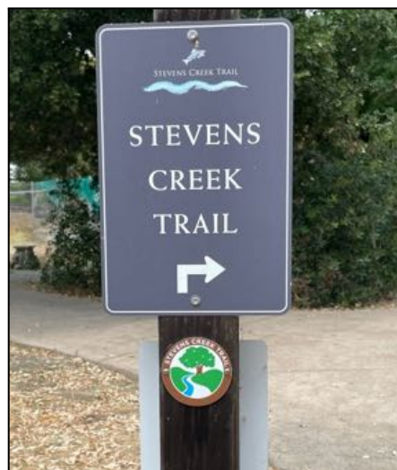
Medallion Installed at La Avenida Trail Entrance & Near Cupertino's Stockmeir House